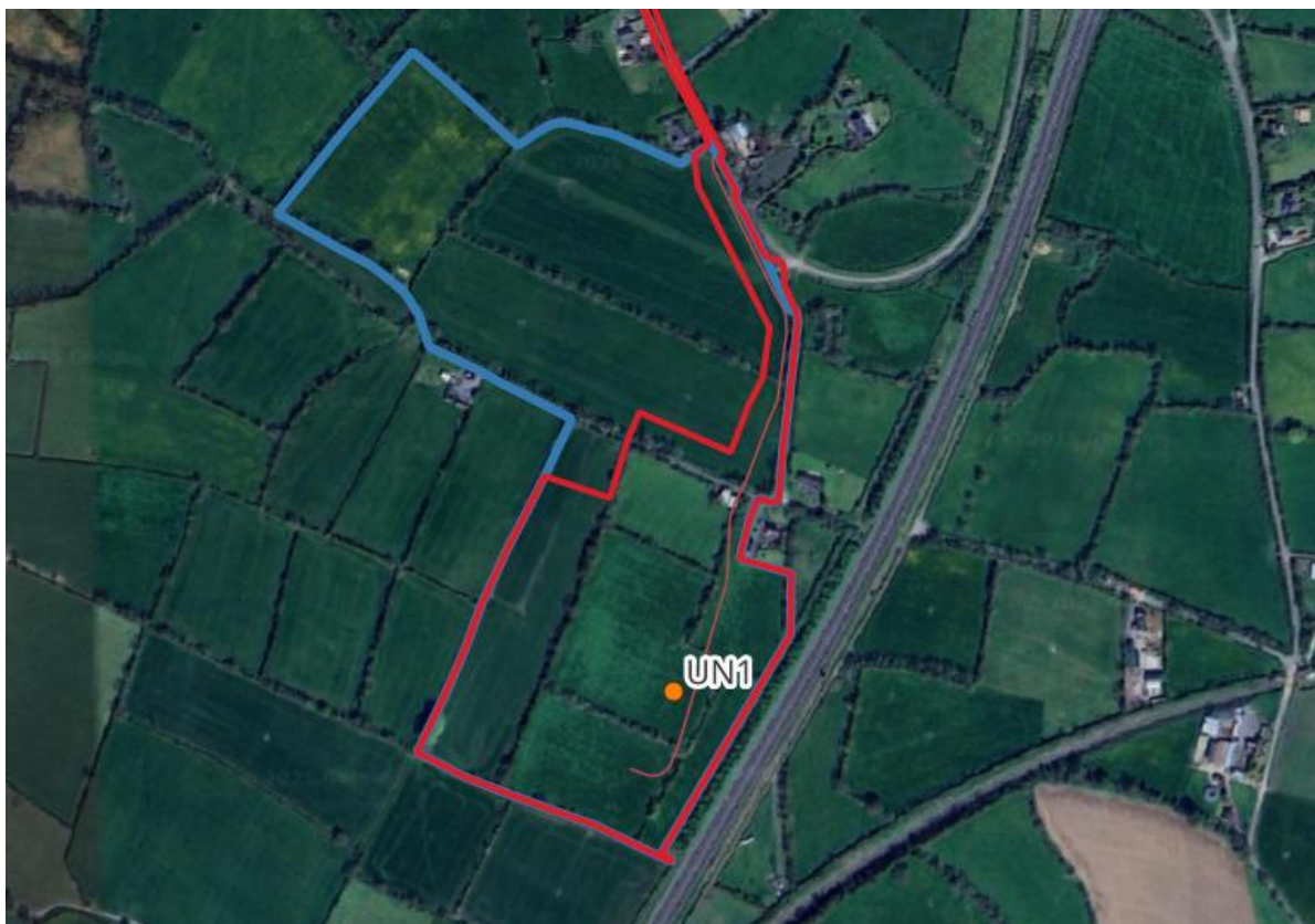
Figure 11.3: Unattended Noise Measurement Location (UN1)