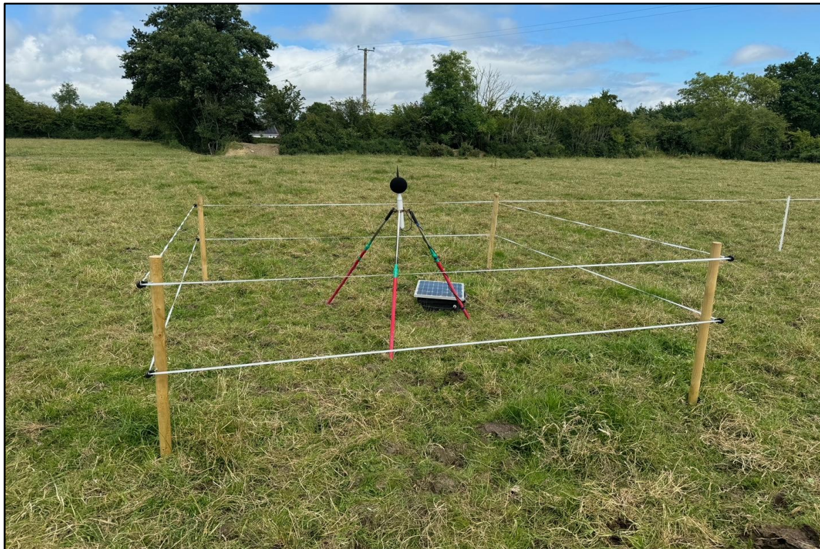
Figure 11.2: Unattended Noise Measurement Equipment